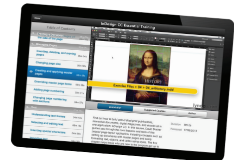
Lynda.com lesson in how to use Adobe InDesign

◆ LYNDA (LINKEDIN LEARNING) provides interactive lessons on how to use different types of software to build technology, creative, and business skills. Covers everything from using a search engine to building a web site.