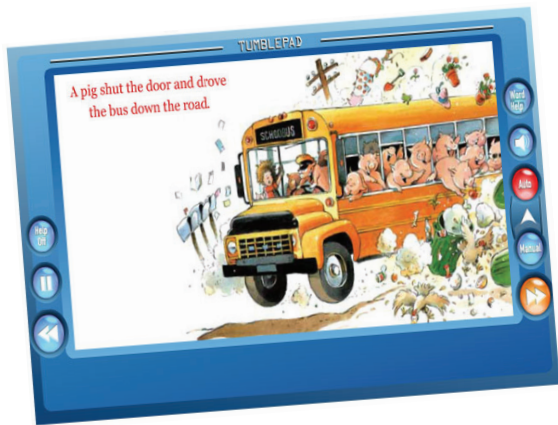
Tumblebooks story page

◆ ABC MOUSE is a fun way to learn and practice the alphabet, counting, early vocabulary, and more.